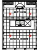
OPT/KITCHEN BEAMS = ON LEFT LOOKING